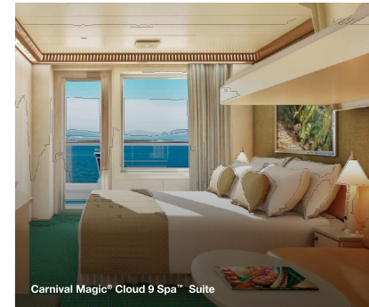
Carnival Magic® Cloud 9 Spa™ Suite

The most affordable way to experience all the excitement without cutting corners on comfort. Full private bathroom, 24-hour room service*, and our famous comfy linens make this the perfect spot to curl up after a long day's fun.