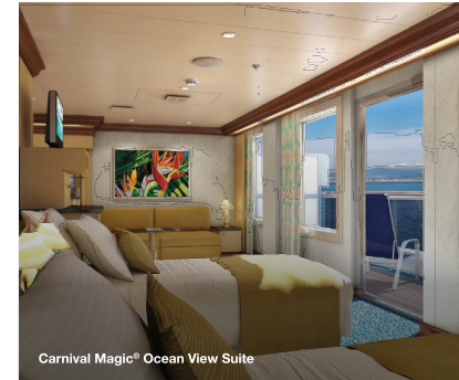
Carnival Magic® Ocean View Suite