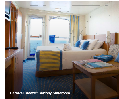
Carnival Breeze® Balcony Stateroom